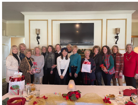
Pictured above is the Bellefonte Country Club Ladies Golf Association who donated toys for our Santa workshop this Christmas.