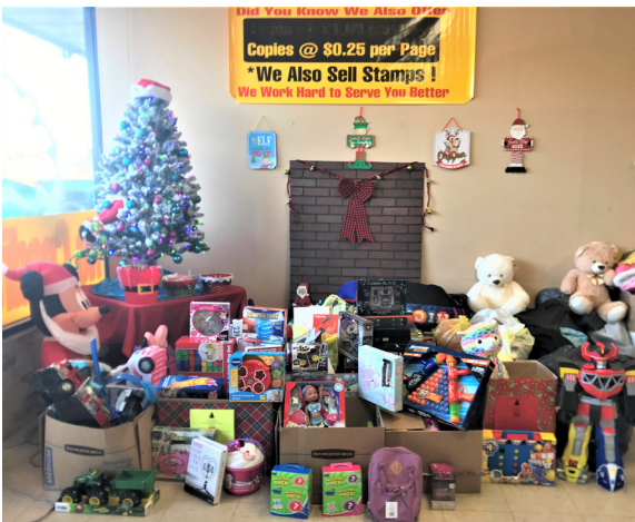
Pictured above is the toy drive at the Cash Express that went to support our families for Christmas.