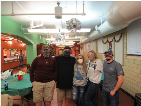
Raceland First Assembly Church brought gifts and served survivors and their families a Christmas dinner.