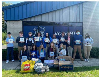
Pictured above are members of the Rose Hill Beta Club who did a donation drive to benefit Safe Harbor families.