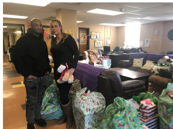
Picture above is Christ Temple Church of Huntington, WV who donated Christmas gifts for all the children in shelter.