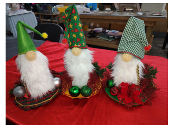
Pictured above left is gift bags and filled stockings for families at our survivor Christmas luncheon. Pictured above right is gnome center pieces made by survivors for our Christmas luncheon.