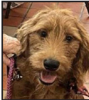
We'd like to introduce our new shelter puppy, Buddy! We are so happy he is here to help our clients.