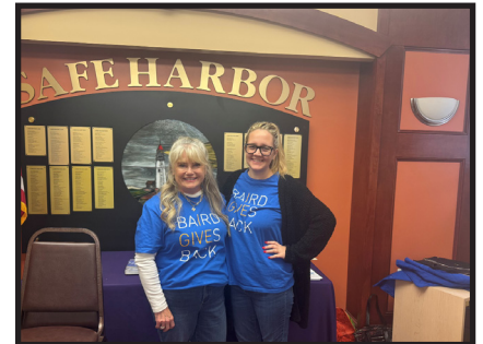
Pictured above is Baird Financial doing a financial literacy class for our clients.