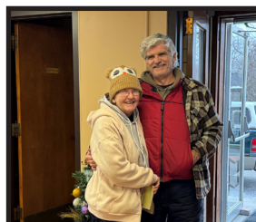
Pictured above is volunteers from the Book Depot who donated toys for our children.