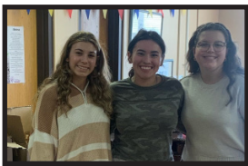
Pictured above is Oakland Church Youth Group Olive Hill who donated Valentine gifts for our clients and kids.