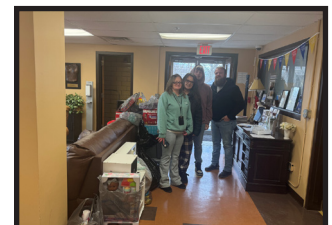
Pictured above is Lawrence County Recovery Center who donated toys for Christmas.