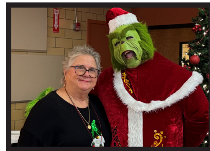
Thanks to the Grinch for showing up for our Christmas Luncheon.